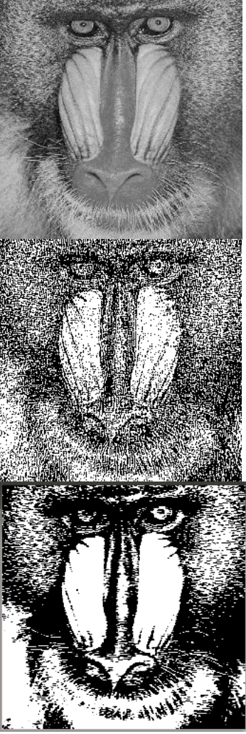
Fig. 2. Baboon and two of textured images.

The results at different stages are shown here. After clustering the different texture categories, we show the a texture specified by the user in these sample images.