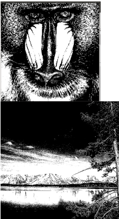
Fig. 6. Reconstructed Images (in grayscale) from the Filters are a good approximation of the Original.