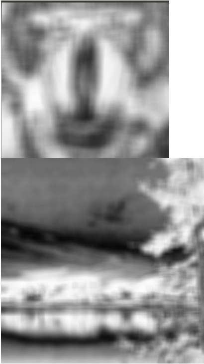
Fig. 5. Feature Images after the Non Linear Transformation Here shown for u_0 = \sqrt{2} cycles image/width and \theta_0 = 90^\circ