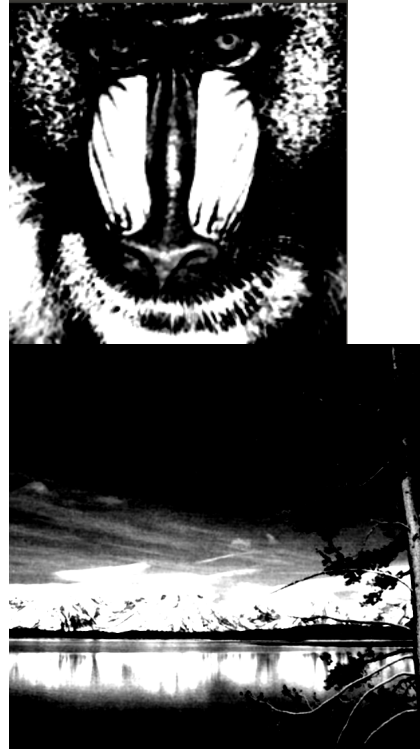
Fig. 4. Examples of Filtered Images at u_0 = \sqrt{(2)}\text{cycles image/width} and \theta_0 = 90^\circ